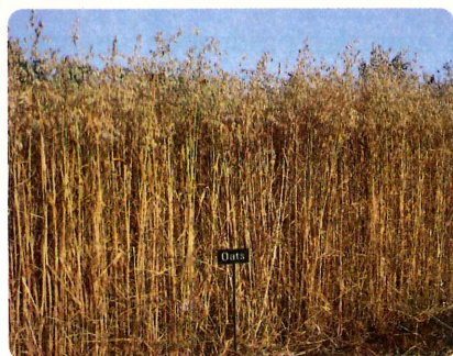
Oats seed crop