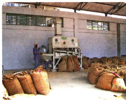
Seed processing unit