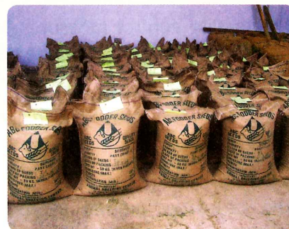
Labelled fodder seed